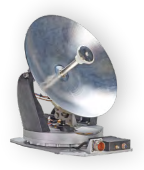
Tail Mount Antenna Business Jet Aircraft