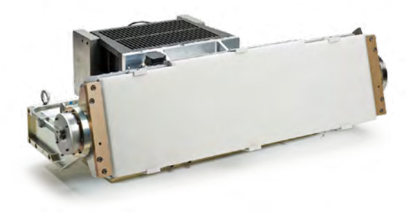
Fuselage Mount Antenna Air Transport Category Aircraft